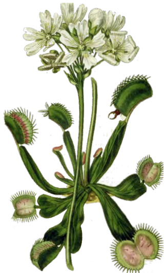
Venus Dionaea muscipula