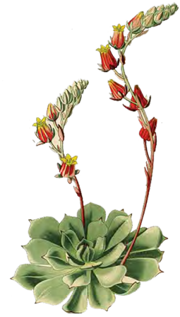
Succulent Cotyledon secunda