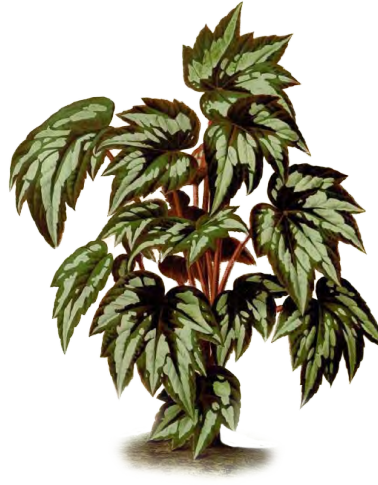
Begonia Begonia clementina