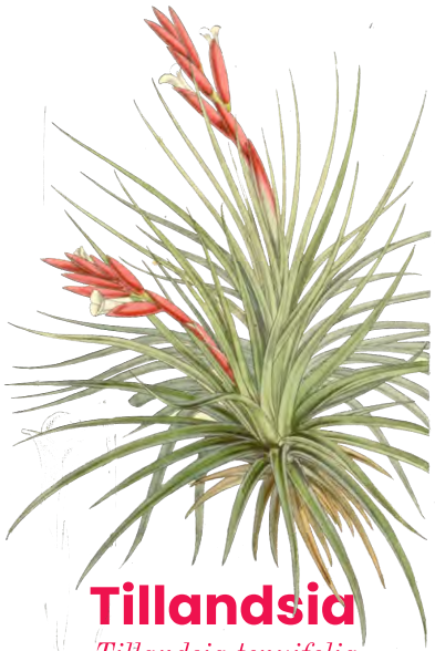
Tillandsia Tillandsia tenuifolia