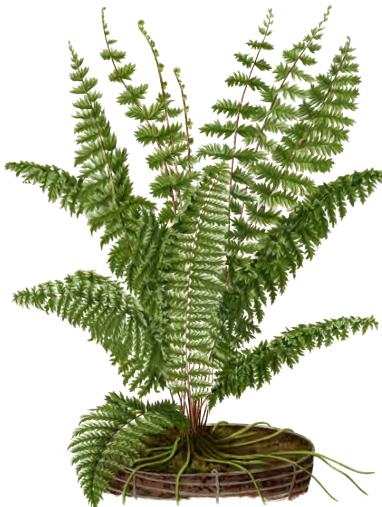
Swordfern Nephrolepis biserrata