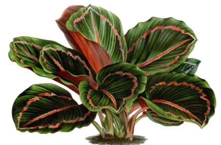
Maranta Calathea roseopicta