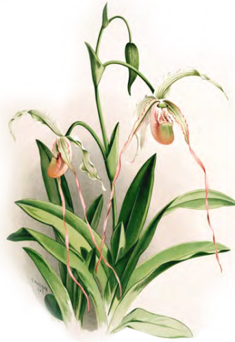
Orchid Selenipedium grande