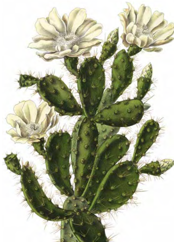
Cactus Opuntia polyantha